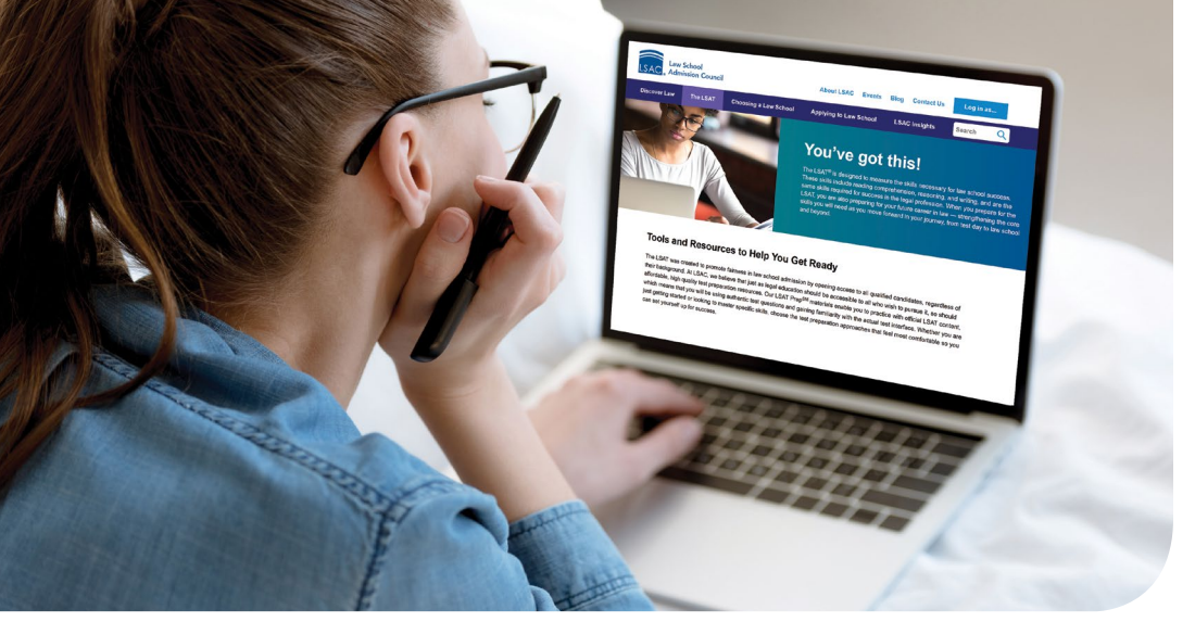
Photo above: Future law student reviewing Official LSAT Prep options at LSAC.org.